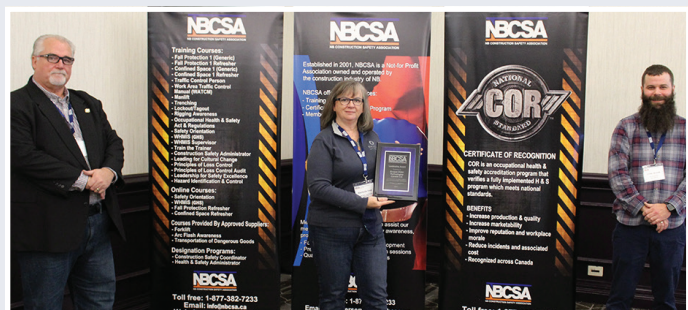
Leadership Award: Evoqua Water Technologies Canada Ltd.