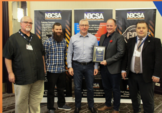
Best Practice Award Bird Construction Company