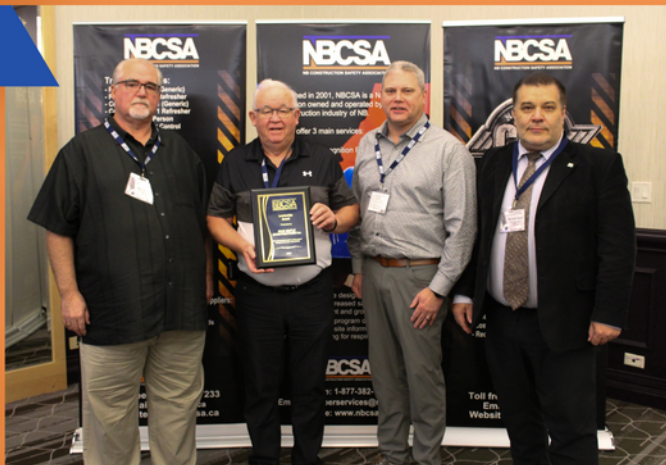
Leadership Award Iron Maple Constructors INC